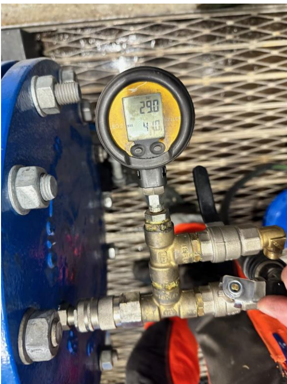
Photo 2. The pipe was pressurized with water up to 29 barg