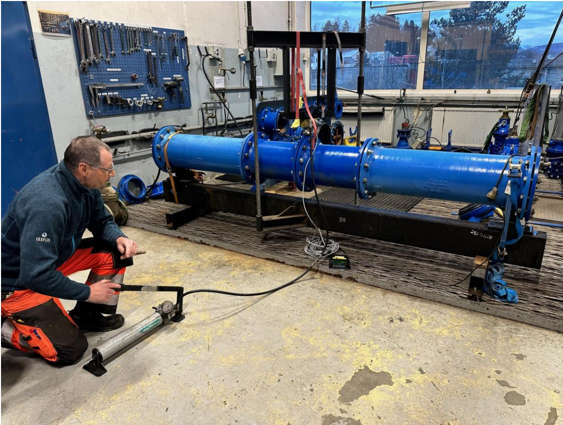
Photo 1. Test setup. 3-point bending test is performed.