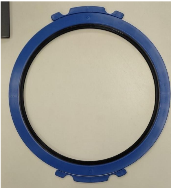
Photo 4. Gasket Dn300